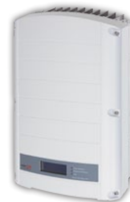
Single phase inverter