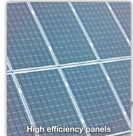
High efficiency panels